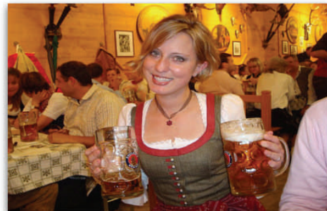
Oktoberfest - Munich, Germany