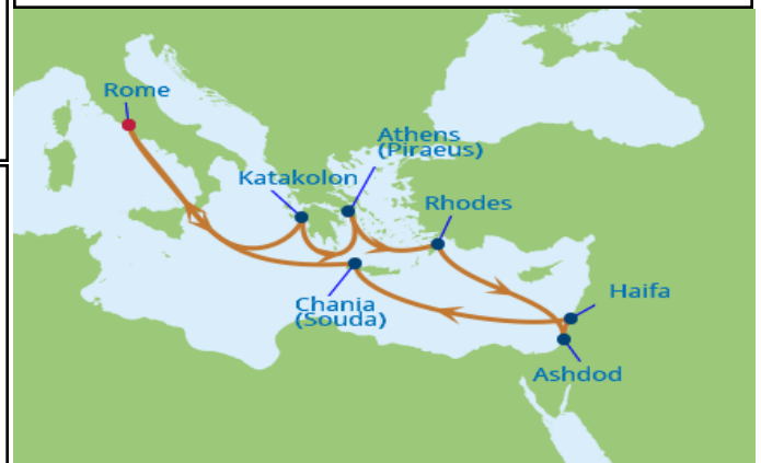
PORT OF DEPARTURE: ● PORT OF CALL: ● CRUISE ROUTE: —